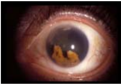
Eye with cataract and damaged iris

rings as part of a study to obtain FDA approval for the Ophthtec Capsular Tension Ring. Approval is expected within the year.