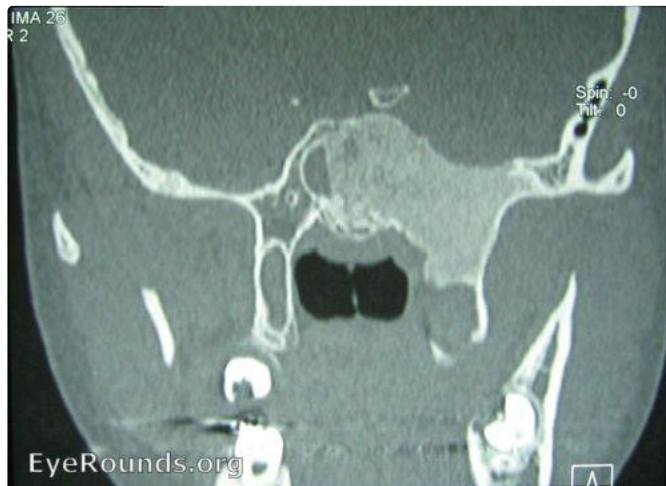
Coronal CT scan