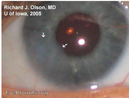
A faint scar can be appreciated on the cornea of the right eye where a larger dermoid was excised 2 years ago.