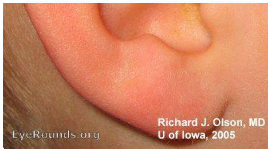
Preauricular skin tag