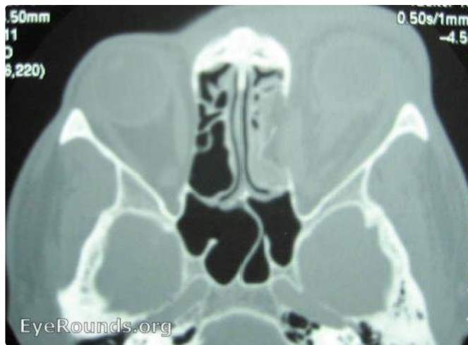
1) Axial CT scan showing medial wall blowout, left side