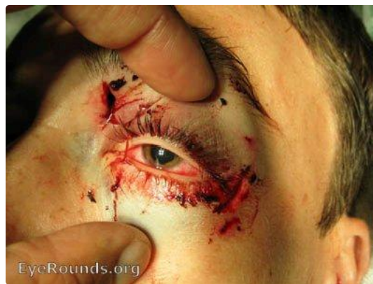
External photos showing peri-orbital trauma. Patient had a microhyphema, but no open globe.