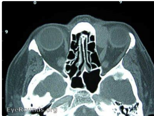
2) Axial CT scan without contrast shows hypodense mass in the medial orbit.