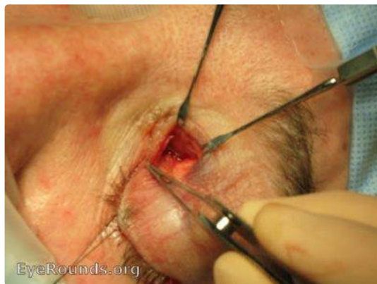
3) Anterior orbitotomy for incisional biopsy.