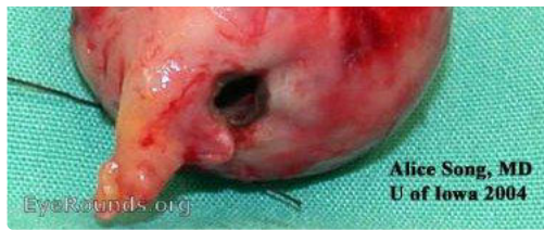
3) Enucleated globe.