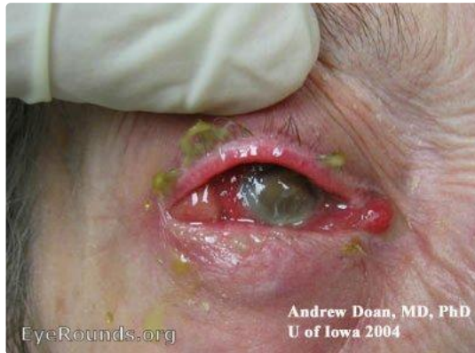
1) Endophthalmitis from infected glaucoma trabeculectomy.