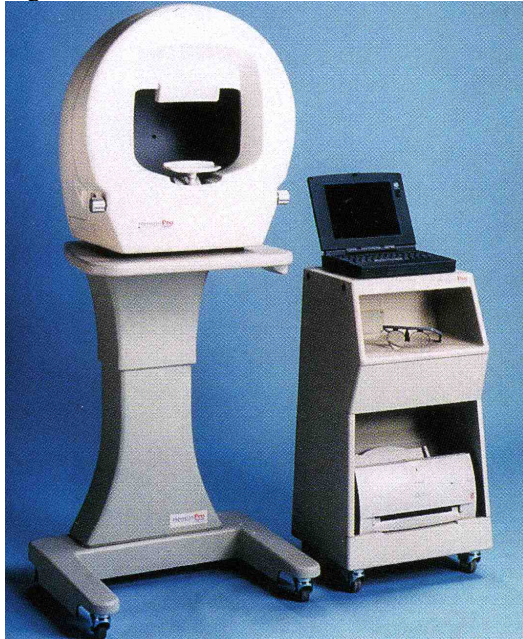
Figure 5 The Henson Pro 5000