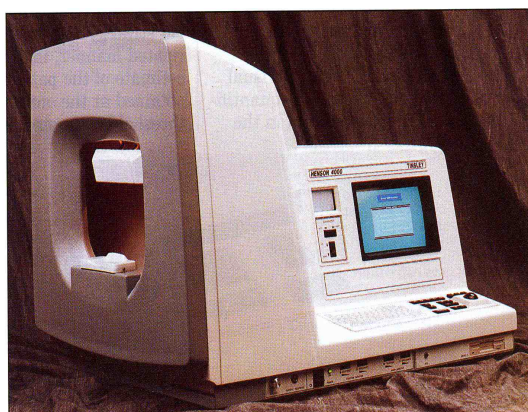
Figure 3 The Henson CFA 4000