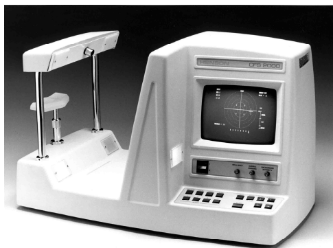
Figure 1 Henson CFS 2000

account the depth of the defect (the CFS2000 quantified the depth of the defect as being at 5, 8 or 12dB above the estimated threshold), the number of defective locations and whether or not the missed stimuli were clustered 13, 14 . The results of this analysis were presented to the practitioner in the form of an arrow and a scale, see figure 2. If the arrow points to the defective region of the scale then there was a less than 1 in 1000 chance that the visual field result came from a patient with a normal visual field. Clinical results with the Henson CFS2000 were reported by Henson & Bryson 1987 9 .