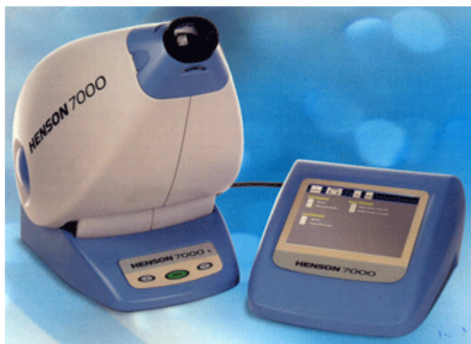
Figure 7 Henson Pro 7000

The Henson Pro 5000/6000/7000 are all still in production (June 2007). Further details can be found at: http://www.weco-uk.com/henson_visual_field_analysers/