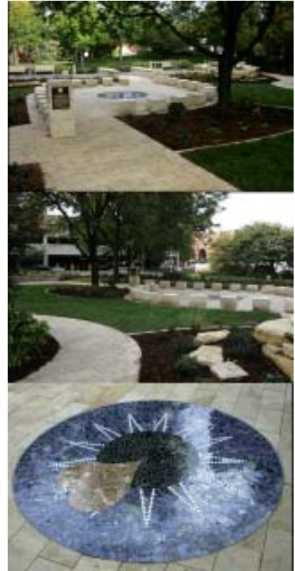
Mosaic designed and produced by Tim Ellsworth

Limestone Pavers: Limestone pavers measuring 1' x 2' will be available for families to further honor their loved ones and the work of donation. Pavers are available in the main memorial ($1500) and on the path leading to the healing circle, as well as on the path leading away from the healing circle ($1000). All pavers will have the honoree's name and city inscribed according to the wishes of the purchaser.