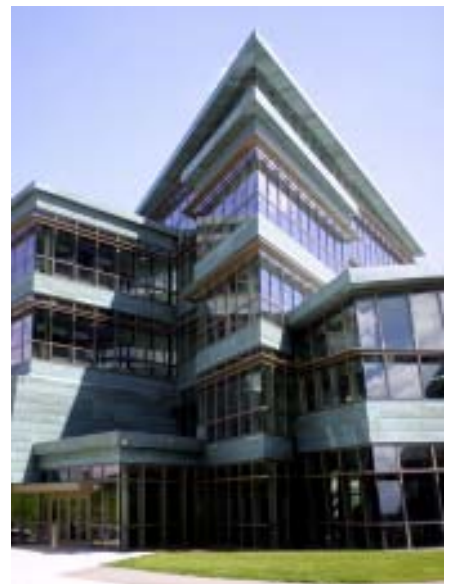
Medical Education & Research Facility