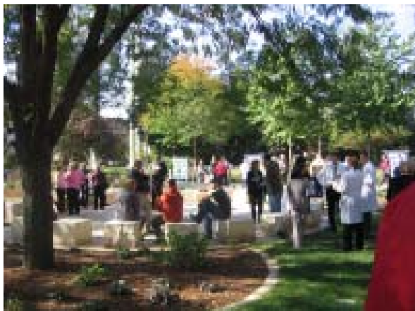
Staff, patients, and visitors enjoy the garden on an idyllic fall day after the dedication ceremony.