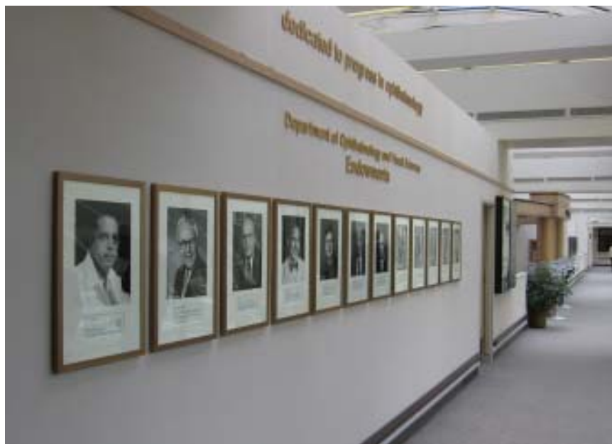
Hallway of Endowments