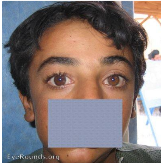
"Congenital glaucoma in a 11-year-old Afghani boy. Please note the bilateral buphthalmos."