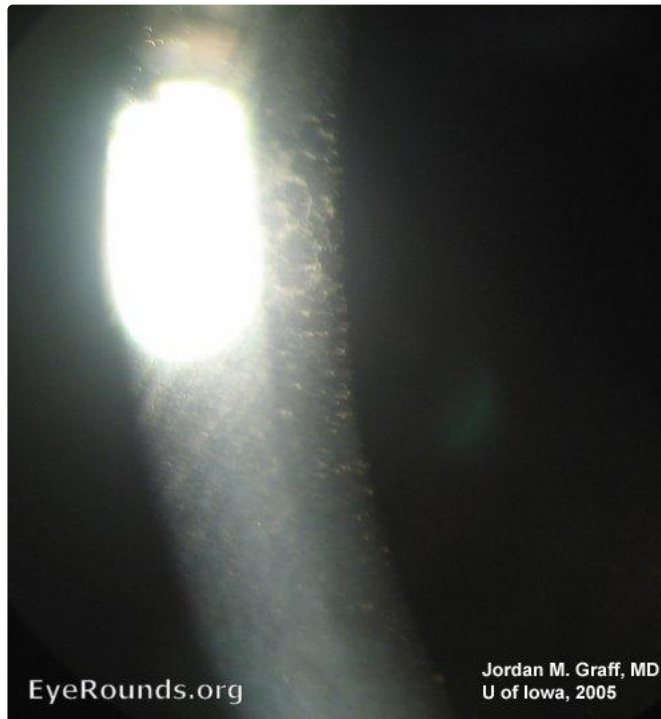
Slit beam view of cornea in a patient with Fuch's corneal dystrophy. By overlying the slit beam with the reflected image of the tungsten filament on the cornea, the examiner can highlight the endothelial surface just to the side of the combined bright spot in the slit beam.