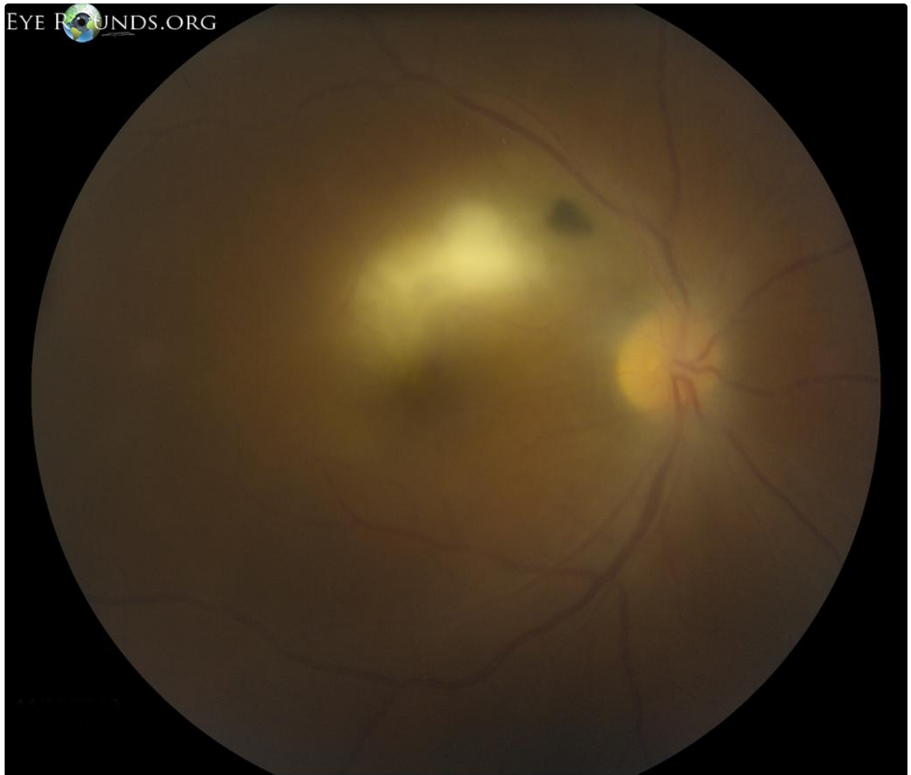
Active lesions have a classic "headlight in fog" appearance with a focal, white, fluffy lesion adjacent to an old scar visible through the associated granulomatous uveitis and vitritis as seen in Figure 1