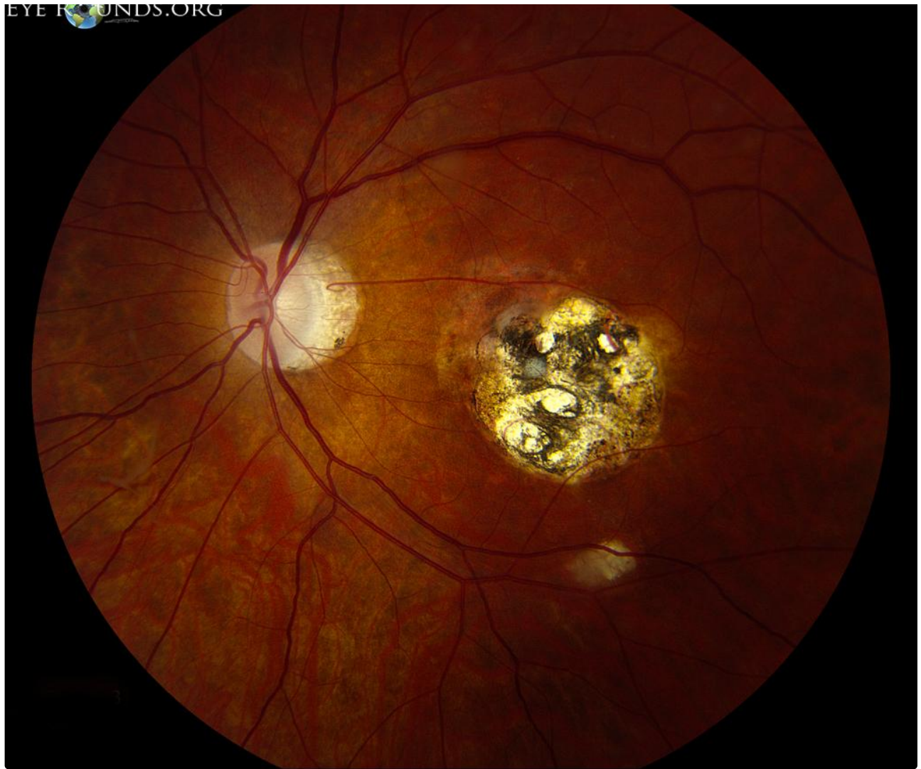
Inactive lesions appear as a chorioretinal scar in the posterior pole, often within the macula as seen in Figure 2.