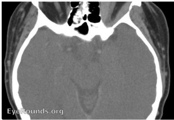
Axial CT scan showing enlarged muscle and optic neuropathy (globe OS is pushed forward with strain on optic nerve).