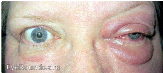
Patient with vision loss over 2 weeks, restriction of gaze, and pain in the left eye.