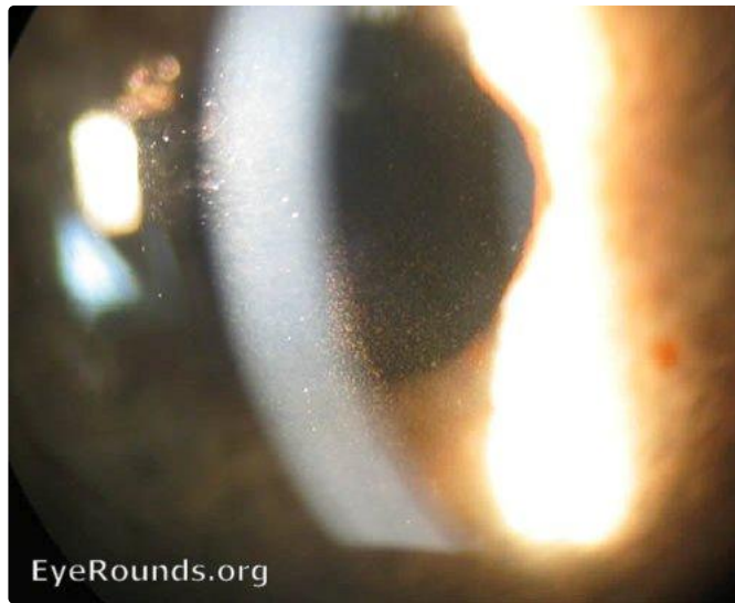
4) Krukenberg Spindle (pigment) dispersed on the corneal endothelium