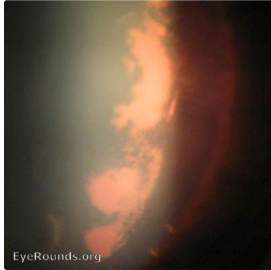
3) Scheie's stripe: pigment on the lens capsule