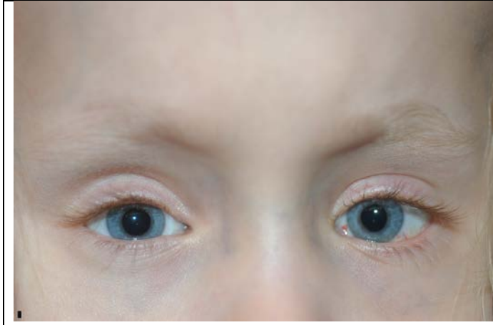
Figure 5: Post-operative photo showing a small residual esotropia and left hypotropia ( \sim 7\Delta ).

The patient did well post-operatively (Figure 6), and has been progressively developing her visual skills. She has done remarkably well overall and is walking and now reading.